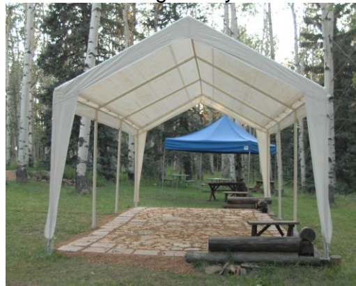
Food Tent & Cake Canopy